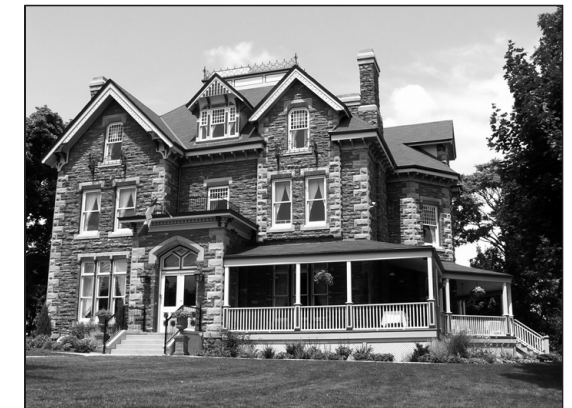
Maplehurst, the Keefer Mansion Inn

Take a stroll on the Discovery Walk and sample Thorold's rich heritage and history. You may decide to do it all at once, or you may prefer to take it a section or two at a time, walking as far as you are comfortable with and returning another day to do some more. No matter how you proceed, you are sure to be surprised by what you see and learn. The total length is about 6.5 km (4 miles). For more in-depth history, try one of our shorter themed walks: the Welland Canal Walk, the Thorold Old Town Walk, or the Historical Canals Walk.